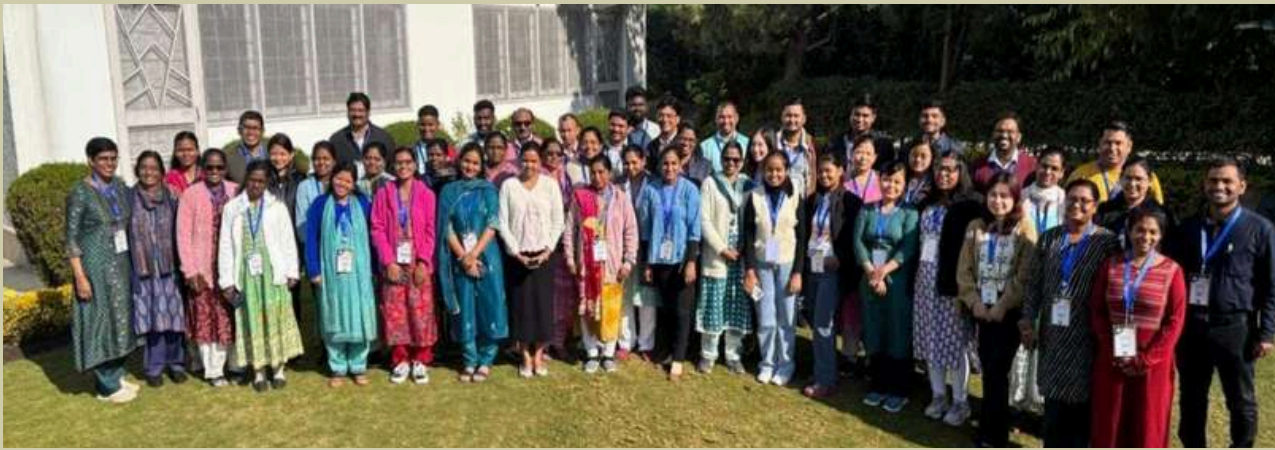
EHA Annual Meeting